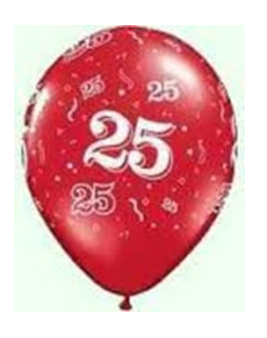
"ECNP is my scientific home"

"For me, ECNP is the only truly committed interdisciplinary scientific organisation for mental health and mental disorders. There is no better place to exchange ideas and critically discuss progress"