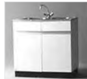
38051 Rental sink unit (Similar model shown)

Please note on the use of commercial dishwashers: The use of commercial dishwashers with a rinse cycle of two minutes or less and the preparation or demonstration of products containing grease and/or oil requires the use of grease traps for the wastewater being discharged (see order form 5.8) (see also "Water connection and supply terms" on page 3).